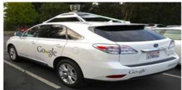
Fig. 8: Autonomous car under development by

depicted in pictures over the centuries, have continuously taken our thoughts. But the lack of technical brilliance and resources probably kept it from becoming a reality, until recently. Eventually, all the factors leading to artificial intelligence shaped up and now driverless cars have become a reality. Well, virtually, it is impartial a substance of time beforehand you start to see real intellect in them. The idea is to authorize the automobile to act like a humanoid motorist and ambition finished various conditions. This may complete easy, but is in not at all method a simple job since a lot of careful calculating is obligatory. Through methods like sensor fusion and deep learning, researchers could develop a technology that would help build a three-dimensional map of all the activities that happen around the car. Some of the leading tech and automotive giants like Google and Tesla are spending millions of dollars in research to come up with better technology and to make autonomous cars a commercial reality.