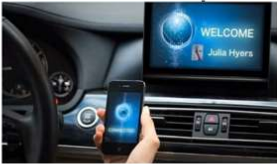
Fig. 13: Infotainment system connected to the automobiles through Wi-Fi

viii) Intelligent Risk Insurance Assessment Always looking for ways to reduce risks, insurance companies have partnered with automotive and technology companies to help identify risky drivers. One such partnership involves Nauto, a technology developer, BMW I Ventures, and Toyota Research Institute, as well as the insurance company Allianz Group. Nauto has established agreements with the others to develop AI-based products that aid in fleet management, logistics, and driver safety. Using deeplearning AI technology, Nauto is developing a cloud based platform that will track driver alertness, near misses, and unsafe driving habits. Eventually, Nauto plans to have a connected car network that will include an ever increasing number of connected cars. Nauto's AI platform and associated network will help fleet companies operate their vehicles more safely and more efficiently. By tracking driver behaviour, the system will help insurance companies identify drivers prone to have risky driving habits. Premiums will, no doubt, be adjusted accordingly. Nauto's efforts represent just one of countless opportunities for innovators in this niche space.