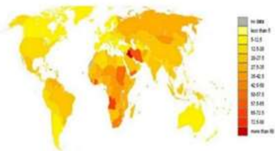
Fig. 4: Road Fatalities per Capital (WHO) ii)Grand Theft Auto

(World report on road traffic injury prevention, WHO, 2004).