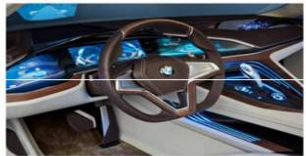
Fig. 12: BMW harnessing the cognitive abilities of IBM Watsonvi) Infotainment System

Insights wanted be drawn from plenty of formless data to decide on how to answer naturally in actual time. Cognitive capabilities wanted be able to switch dynamic operating circumstances as well. Car manufacturers have previously started integrating this into their automobiles.