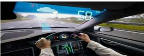
Fig. 11: Internet of Things utilized in an automobile

As a result of 2020, manufacturing specialists approximation that almost 250 million cars determination be associated to the Internet. With new cars coming prepared with a crowd of keen sensors, entrenched connectivity requests, and big data improved geo analytical competences, it only brands intelligence to have an IoT relationship as healthy. At this time are fair a few of the habits IoT technology is impacting, or will quickly impact the motorized manufacturing.