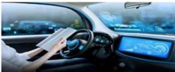
Fig. 10: Vehicle connected to the cloud settings iv) Internet of Things

Cloud computing has certain advantages that make it the perfect platform for staging and deploying AI technology in the automotive field. Among these are fast processing speed, big data access and analytics, and centralized connectivity. As companies endeavor to develop cutting-edge automotive technology, cloud-based platforms will be developed to support them. One instance of anywhere the control of the cloud is being cast-off is the company among General Motors and IBM's Watson supercomputer. An extension of GM's popular OnStar system, the platform being developed will include AI-enhanced features