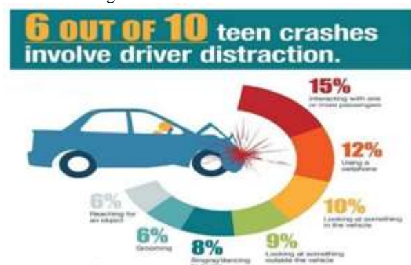
Fig. 6: Reasons for Crashes due to distraction

The safety factor while driving an automobile is something that cannot go neglected. It is one of the key feature that can cause or prevent a catastrophe. Even though all the standard or elite class auto mobiles has been equipped all the latest available technologies that increases the chances of driving safety, statistics tells a different story. As per “accident attorney” website, the major form of distraction is texting, talking to co passenger, high volume music, alcohol etc. And what is more concerning is that majority of them are caused in teenagers.